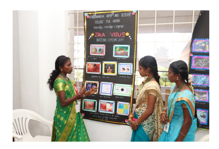
Students at the National Seminar presenting poster