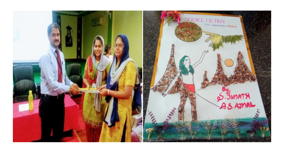
Leaf art by our II B.Sc., Microbiology at the Club Activity organized by the Department of Biotechnology, VIAAS