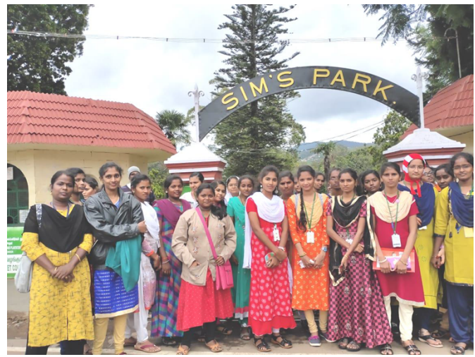
At Sim's Park, Coonoor

Students from II and III B.Sc., Microbiology had an Industrial Visit cum Tour to Pasteur Institute of India, Coonoor on 05.09.2019.