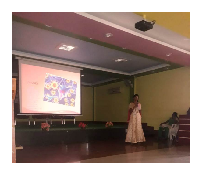
Paper presentation by our Students