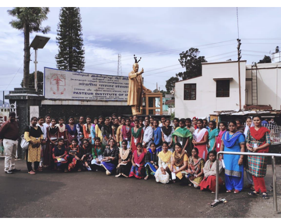
At Pasteur Institute of India